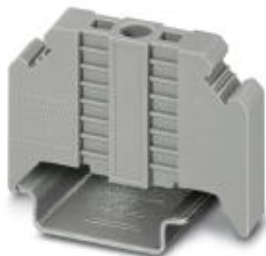
End clamp, width: 9.5 mm, color: gray

Please be informed that the data shown in this PDF Document is generated from our Online Catalog. Please find the complete data in the user's documentation. Our General Terms of Use for Downloads are valid ( http://phoenixcontact.com/download )