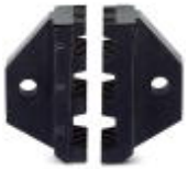
Spare die for CRIMPFOX 25R

Replacement die - CRIMPFOX 25R/DIE - 1212040