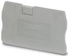
End cover, length: 48.6 mm, width: 2.2 mm, height: 29.1 mm, color: gray

Please be informed that the data shown in this PDF Document is generated from our Online Catalog. Please find the complete data in the user's documentation. Our General Terms of Use for Downloads are valid ( http://phoenixcontact.com/download )