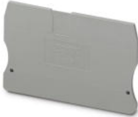
End cover, Length: 71.5 mm, Width: 2.2 mm, Height: 49.9 mm, Color: gray

Please be informed that the data shown in this PDF Document is generated from our Online Catalog. Please find the complete data in the user's documentation. Our General Terms of Use for Downloads are valid ( http://download.phoenixcontact.com )