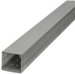
Cable duct, gray, consisting of upper and lower part, width: 30 mm, height: 60 mm, length 2000 mm

Please be informed that the data shown in this PDF Document is generated from our Online Catalog. Please find the complete data in the user's documentation. Our General Terms of Use for Downloads are valid ( http://download.phoenixcontact.com )