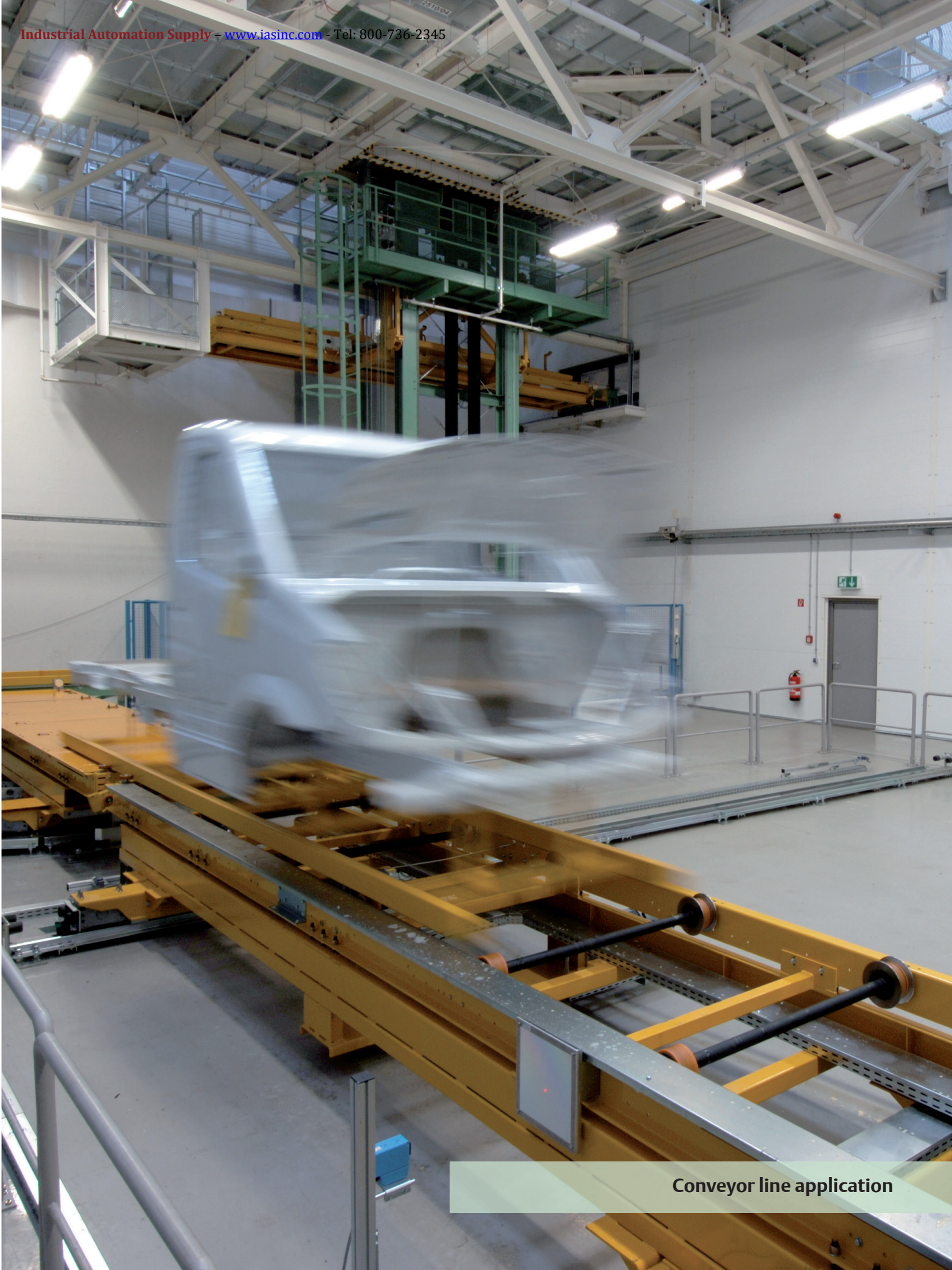
Conveyor line application