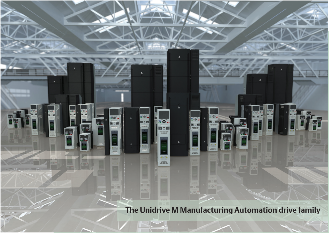
The Unidrive M Manufacturing Automation drive family